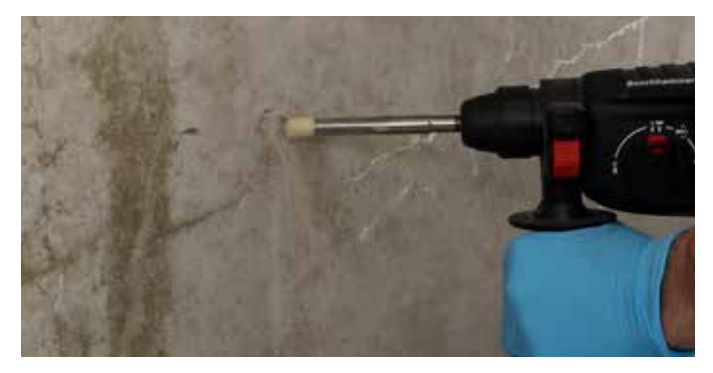
1 Drill holes along the course of the crack on alternate sides at a distance of approx. 10-15 cm and at an angle of approx. 45° towards the crack