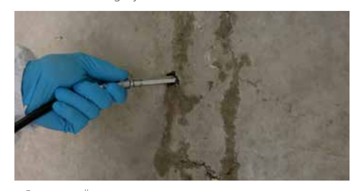
4 Inject KÖSTER IN 8 into the crack proceeding from bottom to top.