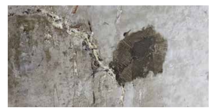
6 Close the boreholes with a mortar e.g. KÖSTER KB-Fix 5.