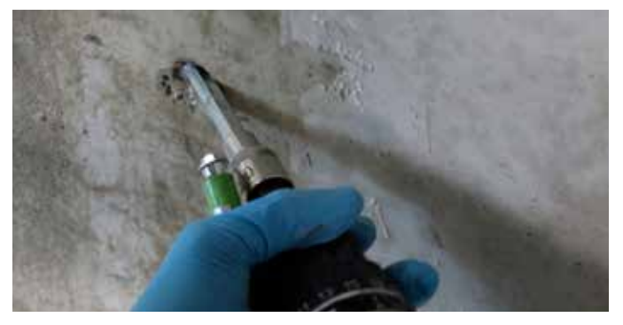
2 Install KÖSTER Superpackers in every second or third borehole. The unclosed boreholes allow pressure release during injection.