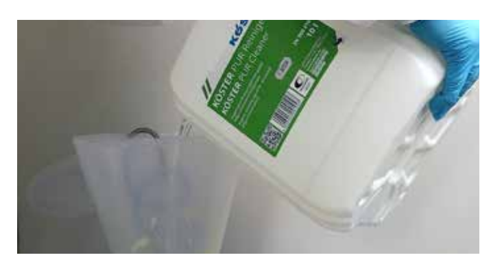
When finished, clean the pump with KÖSTER PUR Cleaner